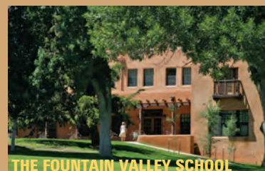
THE FOUNTAIN VALLEY SCHOOL in Colorado Springs, CO, looks upon majestic Pike's Peak.

Though the program is a full one, there is time each day to enjoy the recreational facilities or explore the area.