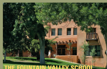
THE FOUNTAIN VALLEY SCHOOL in Colorado Springs, CO, looks upon majestic Pike's Peak.

Though the program is a full one, there is time each day to enjoy the recreational facilities or explore the area.