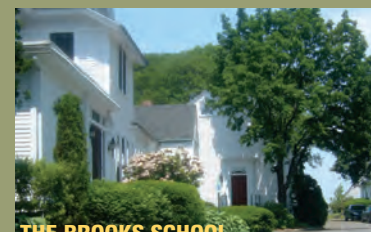
THE BROOKS SCHOOL in North Andover, MA, has a lovely New England feel.